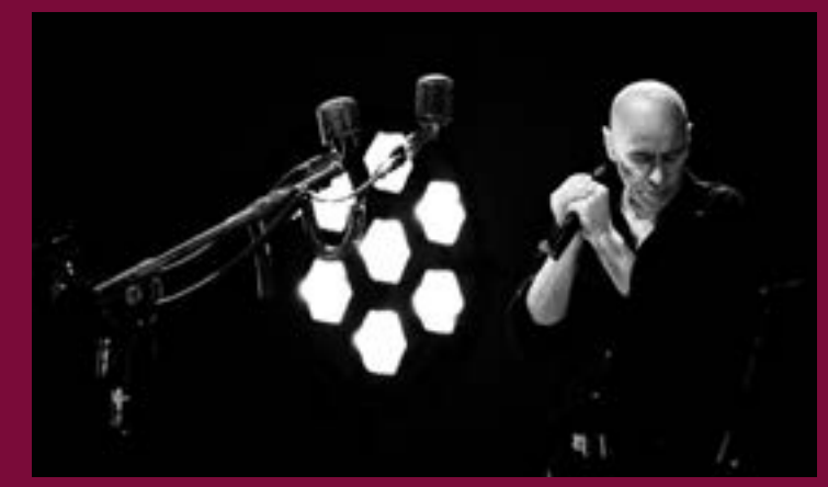
Director: Tim Por Year: 2021 Country: UK

Tim Pope's beautifully shot, unobtrusive film of THE THE's 2018 Royal Albert Hall concert documents the first of a trio of London shows during The Comeback Special tour - all of which sold out within minutes of going on sale. Performing live for the first time in 16 years, the rejuvenated THE THE would go on to play sold-out shows and make festival headline appearance correct the global throughout 2019.