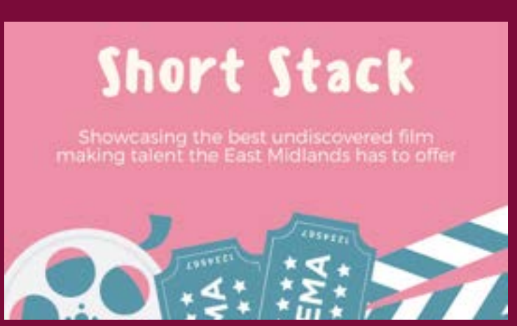
Directors: Vario Year: 2020/21 Country: UK Duration: 90m

Short Stack returns, showcasing the best short films, music videos and documentaries the East Midlands has to offer. If you like your films short and snappy and want to support some home-grown talent, Short Stack is the place to be.