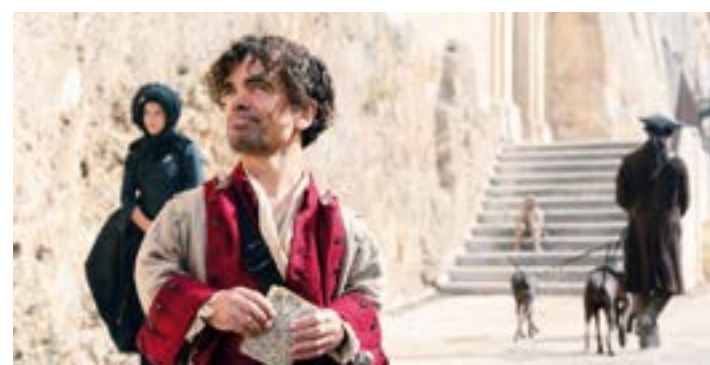
Director: Joe Wright Year: 2021 Country: USA