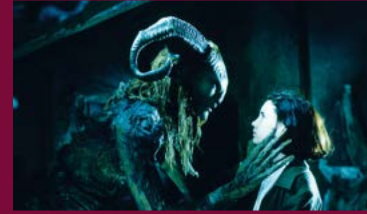
Director: Guillermo del 1 Year: 2006 Country: Spain